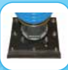
HEAVY DUTY FOOT