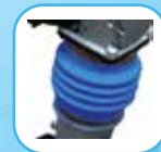
HIGH QUALITY BELLOWS