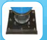
HEAVY DUTY FOOT