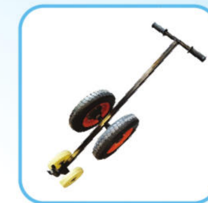
Wheel & Tow