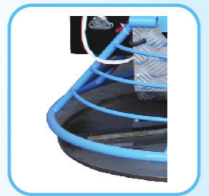
Heavy Duty Guard