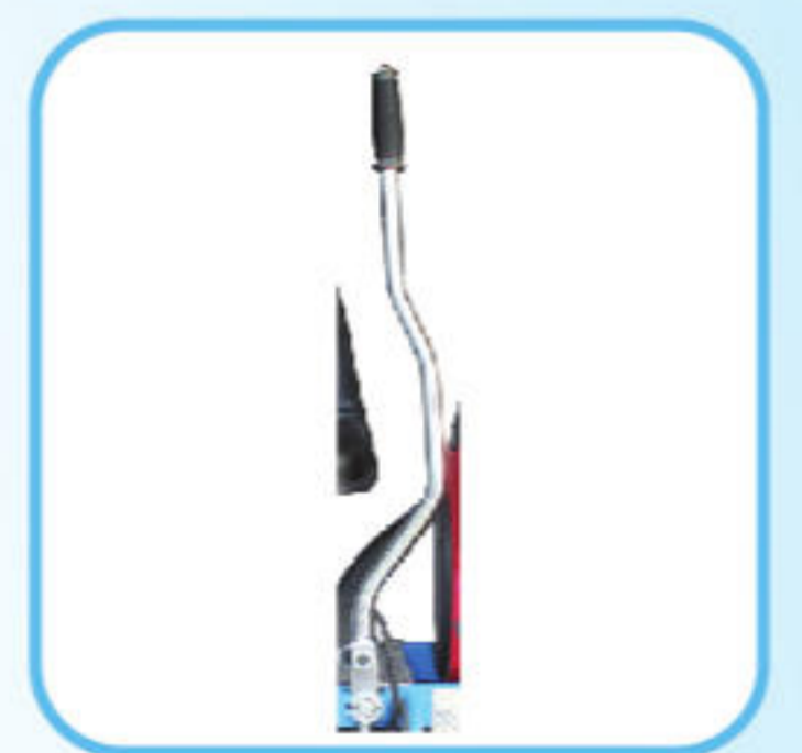
Heavy Twin Stick Steering