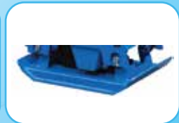
HEAVY DUTY BASE PLATE